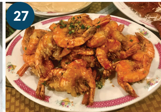
Deep Fried Prawns with Salt & Hot Pepper 椒盐焗中虾