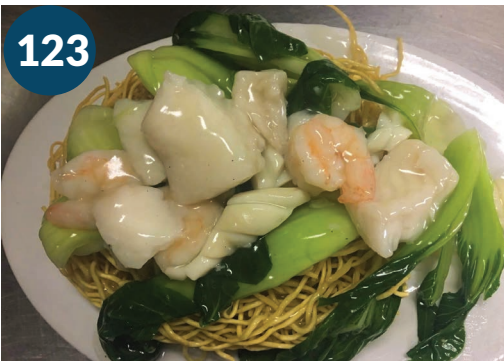
3 Kinds of Seafood Chow Mein 三鮮炒面