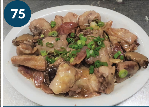
Steamed Chicken with Chinese Mushroom & Sausage 北菇臘腸蒸雞