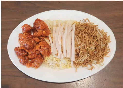
Combo 1 套餐1