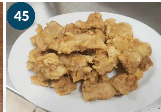
Dry Garlic Spareribs 蒜子排骨