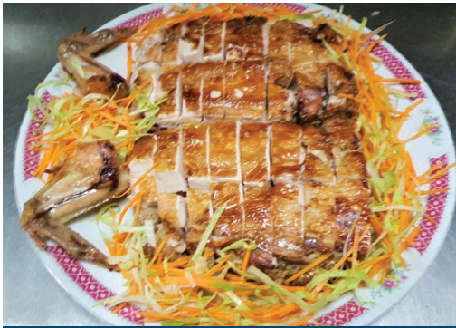
Chicken Sticky Rice (Pre-order 1 day) 糯米鸡(提前一日预定)