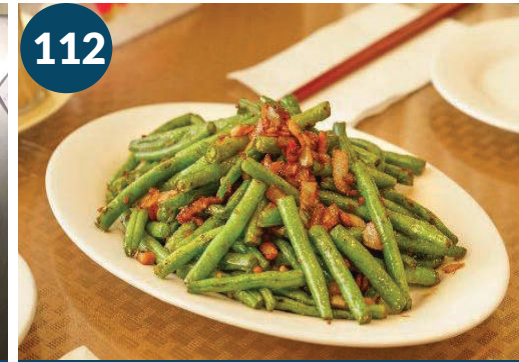
Fried Green Beans in Szechuan Style 干煸四季豆