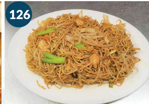
126 Dry Chicken Chow Mein 干鸡丝炒面