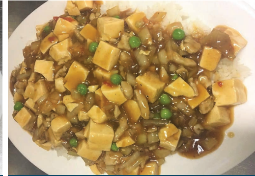
Ma Po Tofu on Rice 麻婆豆腐飯