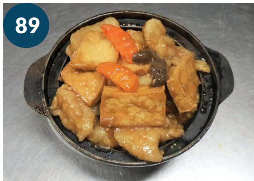
Cod Fillet & Tofu Hot Pot 斑腩豆腐煲