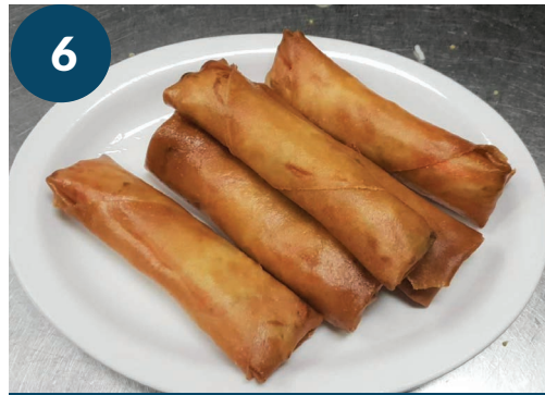
Crispy Spring Roll 酥炸春卷