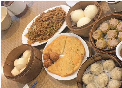
Dim Sum 早茶