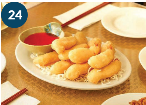
Deep Fried Prawns with Sweet and Sour Sauce 甜酸炸虾球