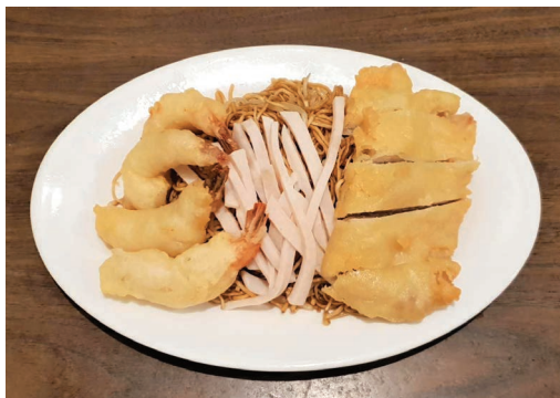
Combo 5 套餐5