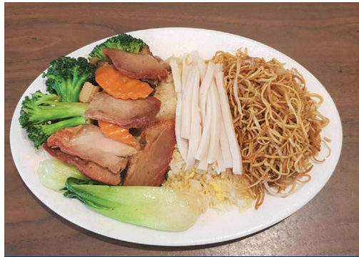
Combo 2 套餐2