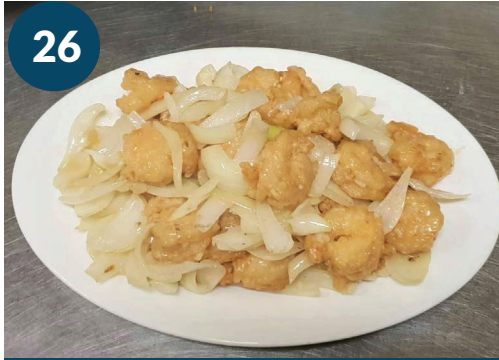
Butter Garlic Prawns 牛油蒜蓉焗中蝦