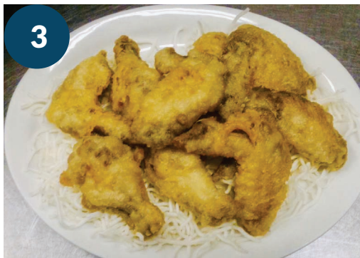
Deep Fried Chicken Wings 酥炸鸡翼