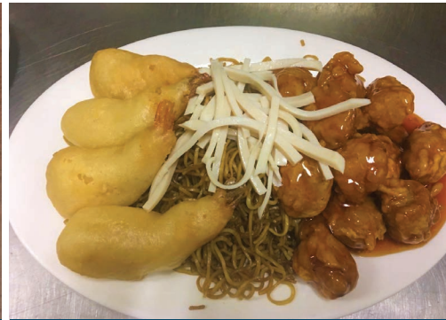
Combo 3 套餐3