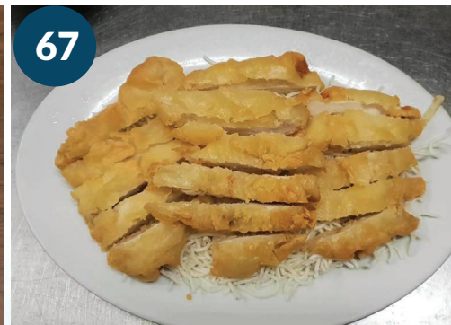
Breaded Almond Chicken 杏仁香酥雞