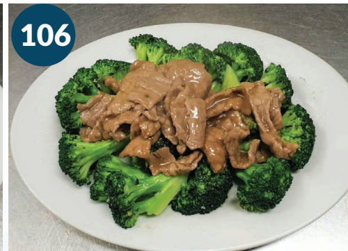
Beef & Broccoli 牛肉百加利