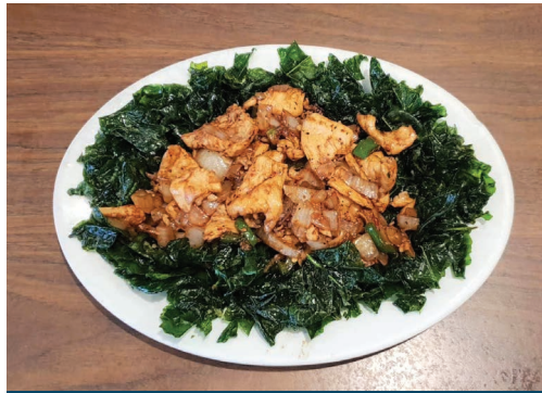
Szechuan Chicken 川椒炒鸡球