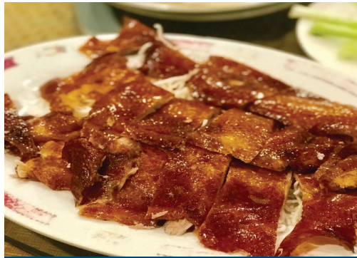
Peking Roast Duck (2 Courses) 北京片皮鸭(两食)