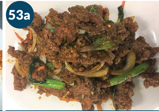
House Special Ginger Beef 姜煸牛肉