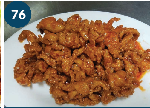
General Tso Chicken (Chili Chicken) 左宗棠鸡