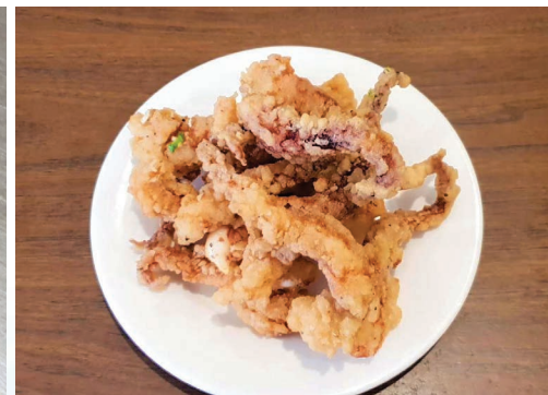
Deep Fried Squid 酥炸鲜鱿