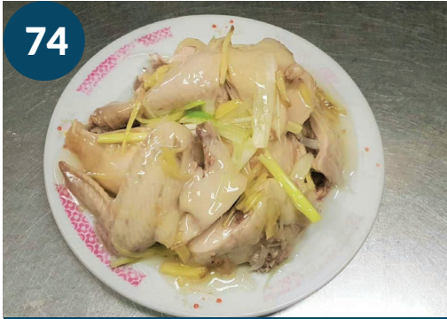
Steamed Chicken w/ Ginger & Green Onions 葱油淋雞