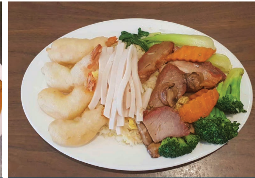
Combo 4 套餐4