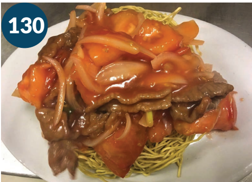
Beef & Tomato Chow Mein 番茄牛肉炒面