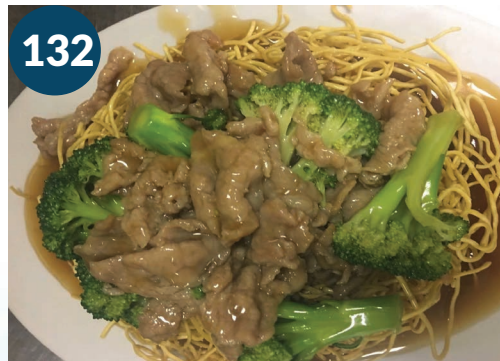
Beef & Broccoli Chow Mein 牛肉百加利炒面