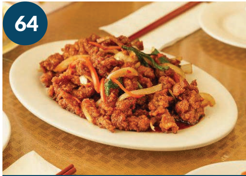
Ginger Beef 干炒牛肉丝