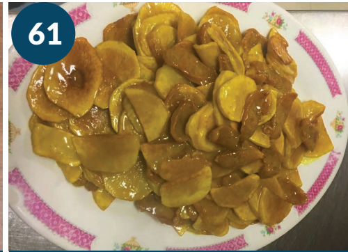
Curry Beef with Potato 咖喱牛肉薯仔