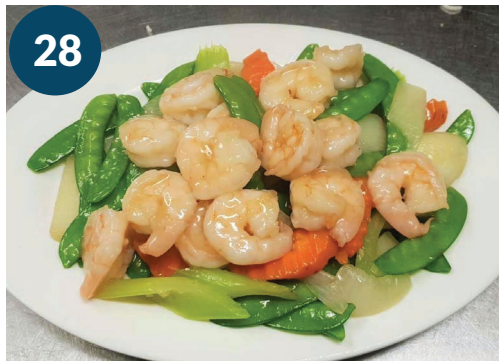
Prawns with Pea Pods 雪豆炒虾球