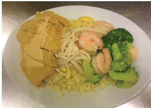
Combo 6 套餐6