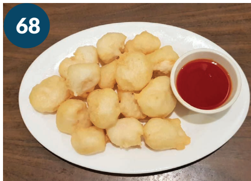
Sweet & Sour Chicken Balls 甜酸雞球