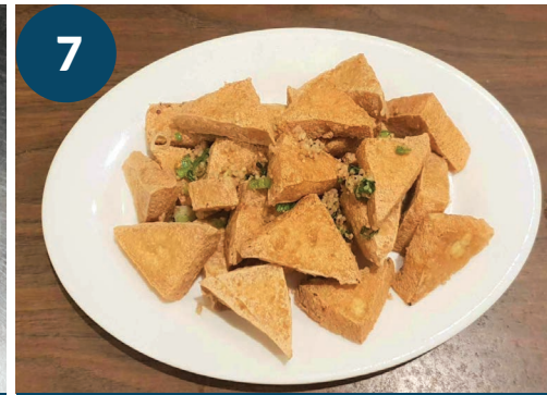
Deep Fried Tofu with Salt & Hot Pepper 椒盐豆腐