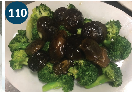
Chinese Mushroom with Broccoli 北菇扒百加利