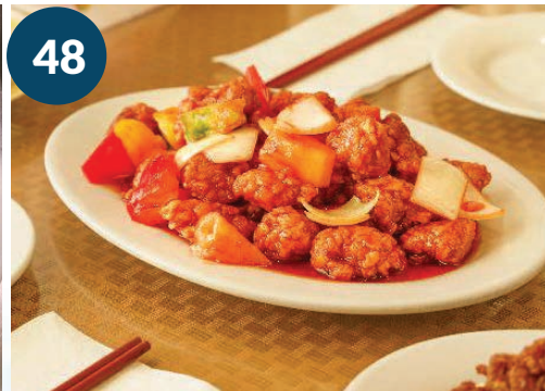
48 Sweet & Sour Pork with Pineapple 菠萝咕噜肉