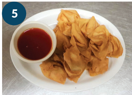
Deep Fried Wonton with Sweet & Sour Sauce 酥炸雲吞